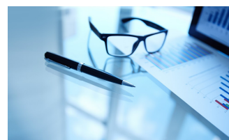
New LANSAs Research