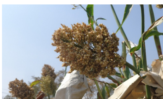
Karnataka Govt invites MSSRF-