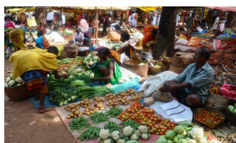
Three LANSAs Research

From July 9 to 13, the 2 nd Agriculture, Nutrition and Health Academy week and the 5 th annual Feed the Future Innovation Lab for Nutrition (Nutrition Innovation Lab) Agriculture-Nutrition Scientific Symposium will be held in Kathmandu with several research consortia presenting evidence-based research for audiences. LANSAs researchers will host a policy dialogue, present at the scientific symposium, mini poster sessions and conduct learning lab sessions.