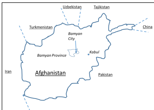
Figure 1: Bamyan Province, Afghanistan

Using irrigation water from the mountains, Bamyan has become the centre of a thriving potato-growing industry which has changed production patterns and has influenced economics and diets significantly in the last 15 years (Ritchie and Fitzherbert 2008; potatopro.com 2017). For many small-scale producers, annual legumes and pulses have been replaced by potato production as a staple cash crop to the extent that potato is a monocrop within a small radius of Bamyan City, with inherent dangers ‘in such a fragile and vulnerable agro/economic environment’ (Ritchie and Fitzherbert 2008:8).