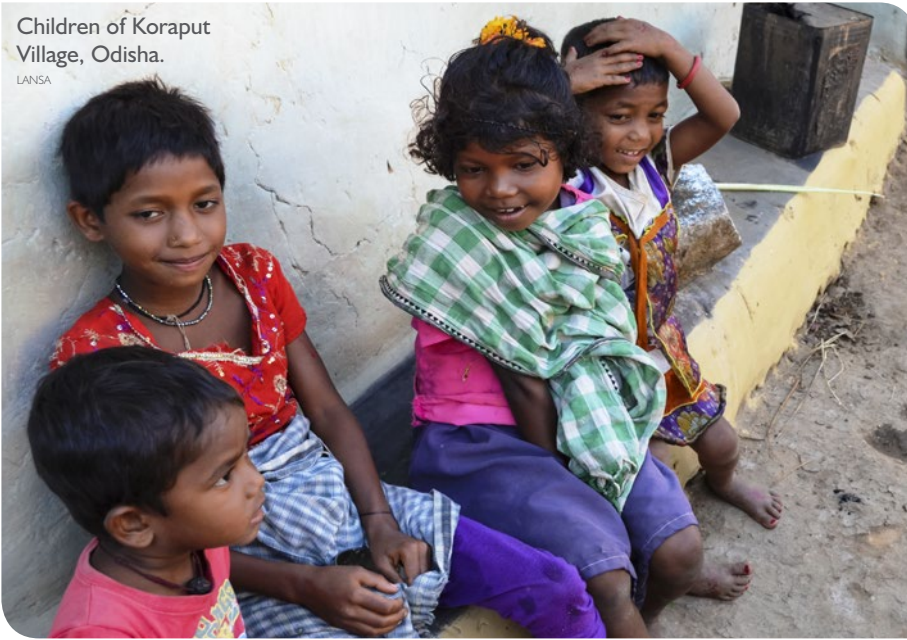
Children of Koraput Village, Odisha. LANSA